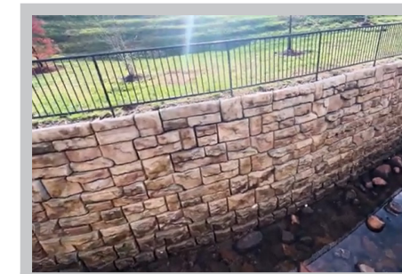
Gravity Wall with Safety Railing