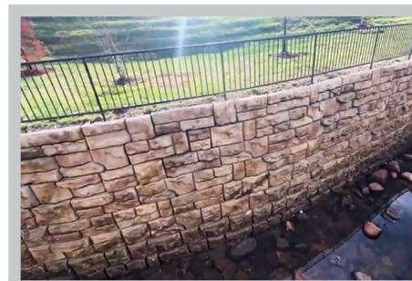
Gravity Wall with Safety Railing