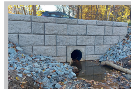
Rock Façade Finish