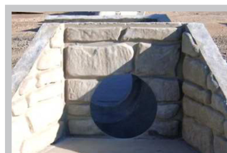
Rock Façade Finish